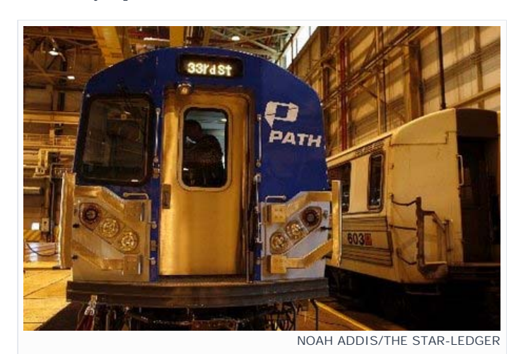
There's a new group that has posted an online survey so people can tell the Port Authority what they think of the PATH. Named "PATHSUX" it's clear what the survey's authors think.